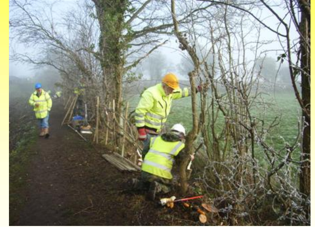
Hedge-laying on a frosty morning. We have laid about one mile of hedge over nine winters.