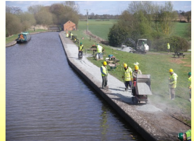
Maintenance at the Weston Arm picnic area. The work included re-surfacing the towpath, constructing new approaches to allow wheelchair access, painting tables and repairing brickwork.