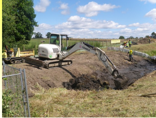
Channel excavation between Bridges 84 and 85. The current project is about 800 m but will extend navigation by 2 km. A grant from the HLF means that this project is already fully funded.