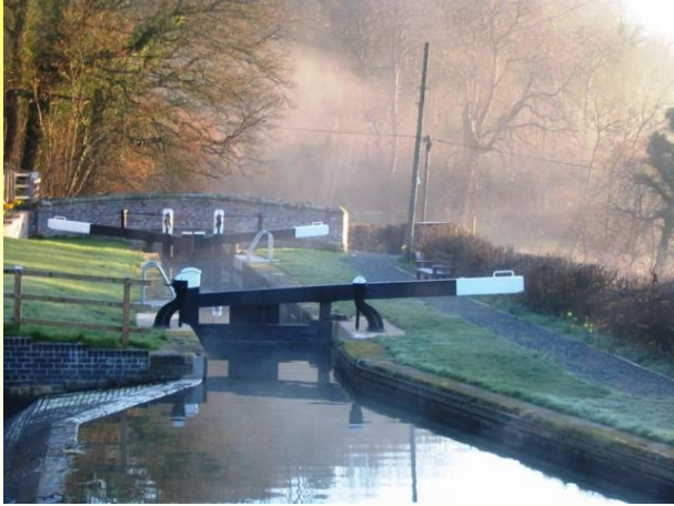
Newhouse Lock after restoration by the Society. The project won the Royal Institute of Chartered Surveyors' Welsh Project of the Year award.