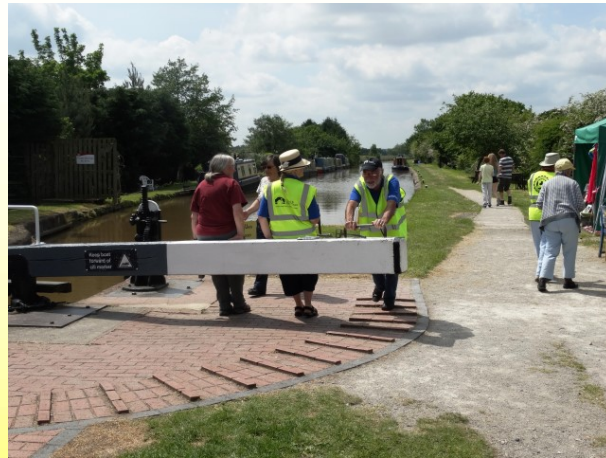
A fundraising 'lock-wind'.