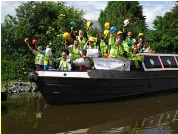
Our volunteers in 2014, celebrating re-watering between bridges 83 and 84. Over 400 m of channel was excavated and lined and over 40,000 concrete blocks were used to cover the waterproof lining.